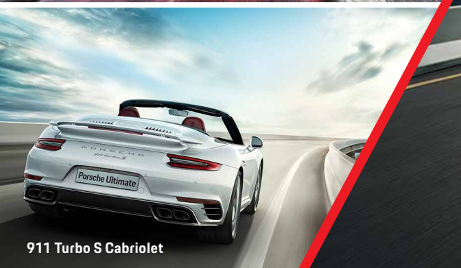
911 Turbo S Cabriolet