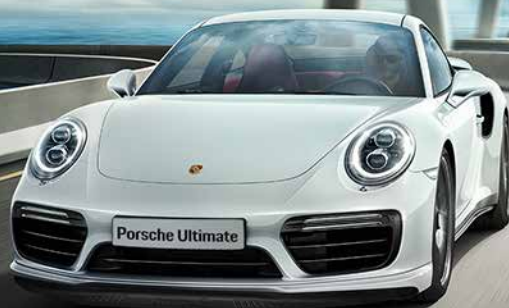
911 Turbo S Coupé